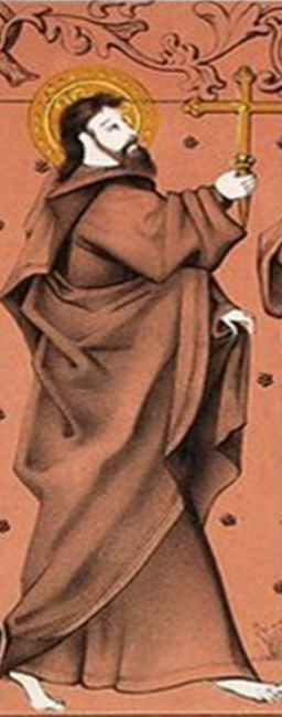
The Apostle Philip

Best remembered for defending the teaching that Christ was fully God against those who taught otherwise, Athanasius was an influential church leader around the time of the Council of Nicea. He was banished from Alexandria five times for his forthright views.