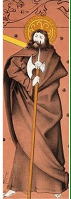
Apostle James the Less

Philip was one of the first disciples of Jesus, and called Nathanael to "come and see." He later responded to an Ethiopian official's request for teaching and baptism. Little is known of James, the son of Alphaeus, called "the Less" to distinguish him from another apostle named James.