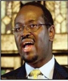
Rev. Clementa Pinckney