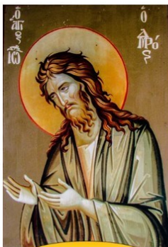
JOHN THE BAPTIST